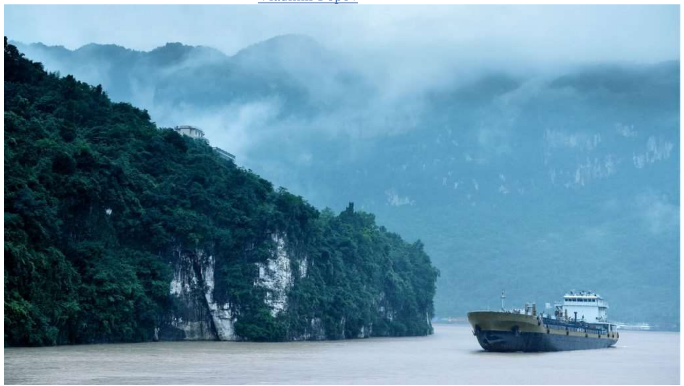
China, The Three Gorges

The Kyoto Protocol, which was signed in 1997 and came into force in 2005, envisaged binding targets for cutting emissions only for industrialised countries (so-called 'Annex I' states), but not for developing ones. The understanding at that time was that it is first and foremost Western countries which should deal with climate change problem.